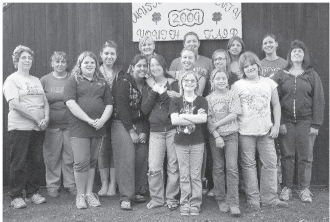
Tip Top Riders club members.