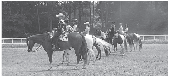
Judging for the Western Pleasure