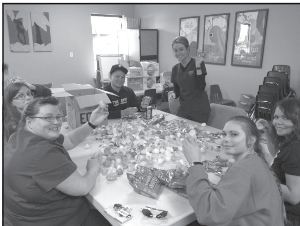
Journey Church volunteers putting eggs together