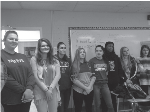
The new Leos