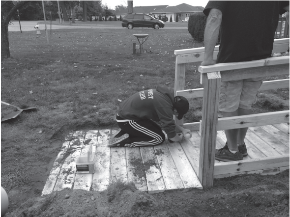
Working on a ramp project