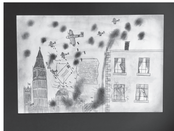
Seth Geiger - 7th grade