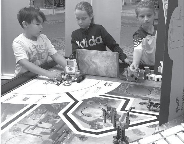
Interested kids check out the FIRST Lego League table-top playing field at “Robo-con”.