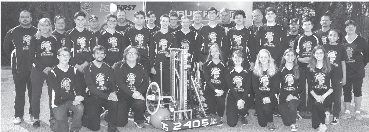
Team photo 2019.