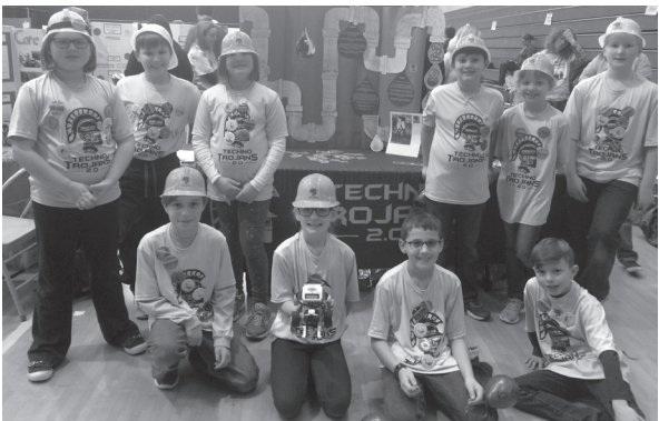
The Fruitport robotics “FIRST Lego League” team , named the “Techno Trojans 2.0”, winners of the Innovative Solution award in 2017.