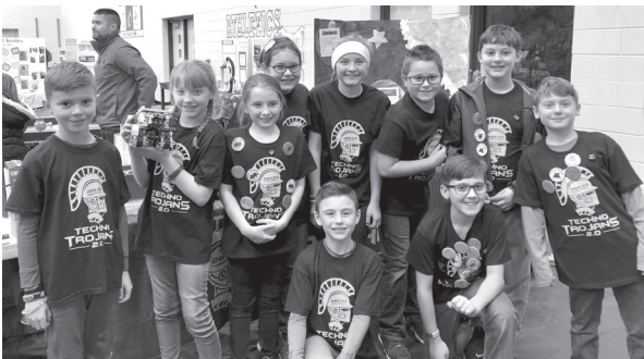
Fruitport's 2018 “Techno Trojans 2.0” FIRST Lego League robotics team.