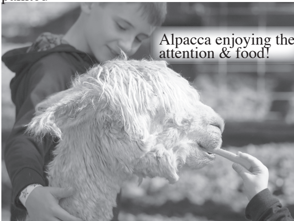
Alpacca enjoying the attention & food!