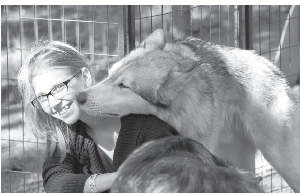
A very friendly wolf!

If you have a song on your heart, come and sing it!