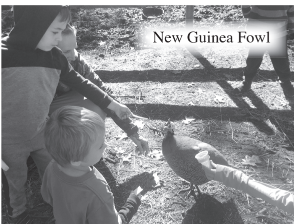
New Guinea Fowl