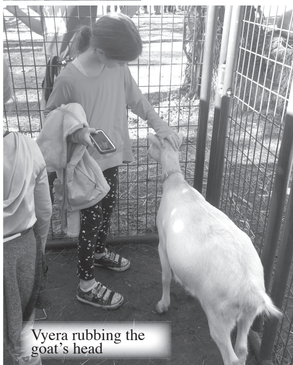
Vyera rubbing the goat's head