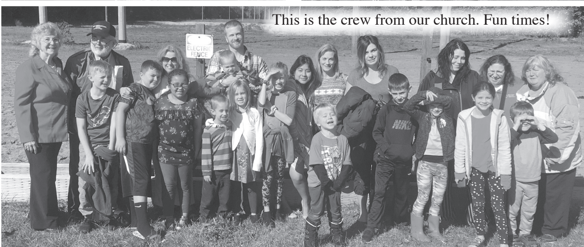
This is the crew from our church. Fun times!