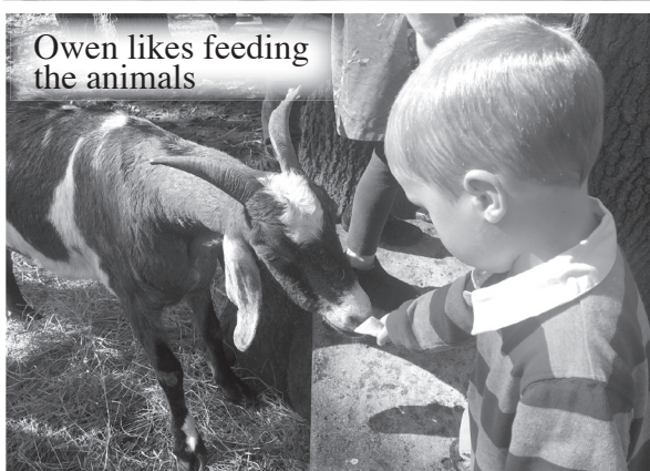
Owen likes feeding the animals