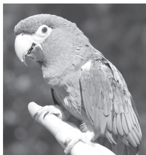
The green parrot who let people hold him