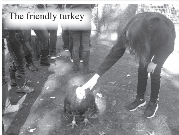
The friendly turkey