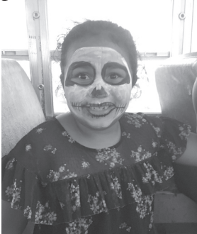
Brooklyn with face painted