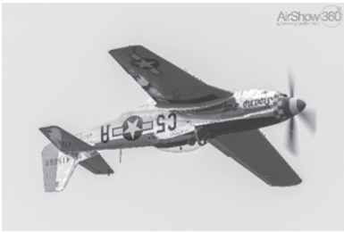
Swamp Fox piloted by RT Dickinson