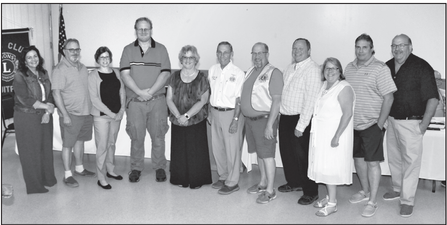
New Board of Directors

Fruitport Lions club are always looking for new members with a heart for their community. If you would like to join the Fruitport Lions please contact any of the above Lions or just come and attend a meeting. The club meets the 2nd and 4th Wednesdays at Whitlows Forerunner Restaurant on Airline rd. 6:30 p.m.